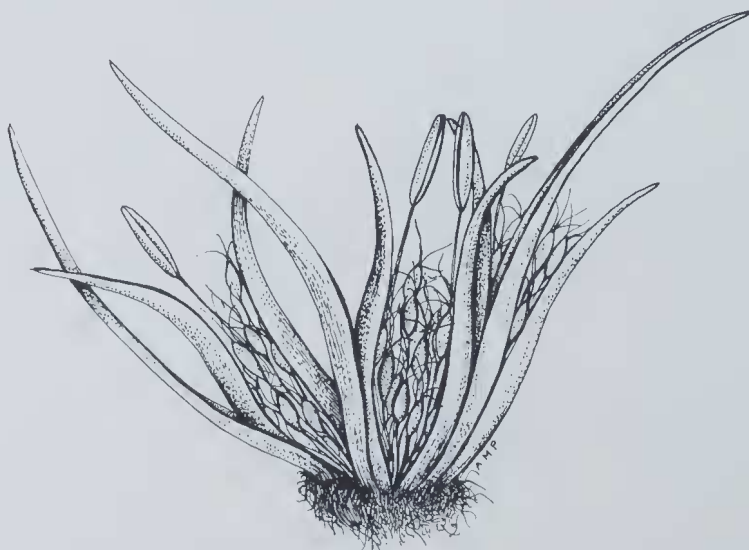
Fig. 4. Plant of Trithuria lanterna (several leaves and bracts removed), showing flowering heads, x18 (BRI 256563).

In Trithuria submersa Hook. f. the fruit dehisces by 3 caducous panels, leaving a framework formed by the 3 vascular ribs (Hooker, 1858). The released seed is the disseminule and has a thick, sculptured testa which may be an adaptation to hydrochory, rendering the seed unwettable and thus able to float on the surface film.